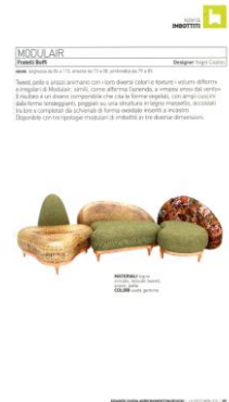
ARREDAMENTO & DESIGN 2010-2011 LA REPUBBLICA P89

For further information +39 0362 564304 info@fratelliboffi.it – www.fratelliboffi.it