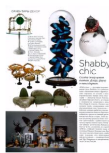
INTERIOR + DESIGN RUSSIA MAJ 2010 P22