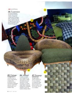
AD FRANCE JULY-AUGUST 2010 P26