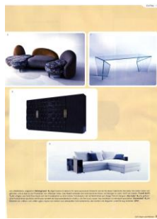
RAUM UND WOHNEN SVITZERLAND MAJ 2010 P91