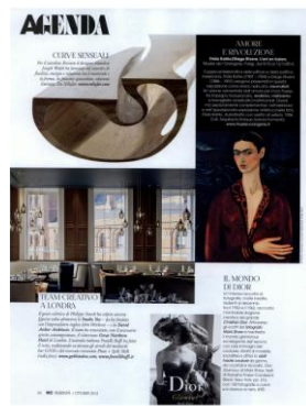
Marie Claire Maison October 2013