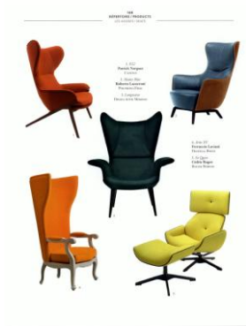
AD Collector FR September 2013

Many are the Italian and foreign editorial publications which used Fratelli Boffi products in their articles.