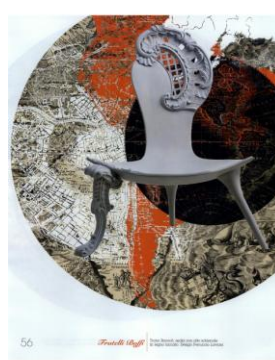
MFL October 2013