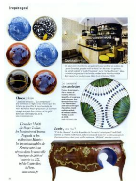
Marie Claire Maison FR November 2013