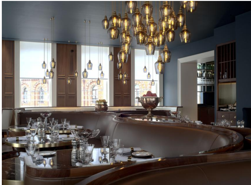
Restaurant Plum + Spilt Milk