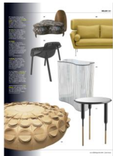
IDFX UK JUNE 2010 P21