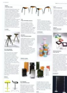
DOMUS JULY 2010 P136 JULY AUGUST 2010 P73