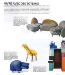
ESPACES CONTEMPORAINS SVIZZERA P189